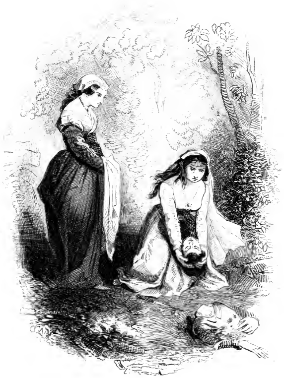
THE PART OF BARKLE